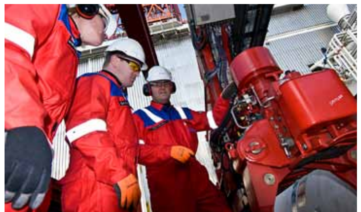
More tasks will be carried out in highly-skilled inter-disciplinary teams

Our employees will see the effects of the reorganisation in that more tasks will be carried out in highly-skilled inter-disciplinary teams drawn from across our departments. Our customers will benefit from this by receiving the very best solutions.